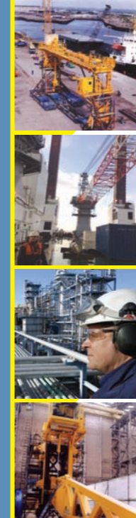
Head Office Stokesley